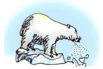
blow the snow