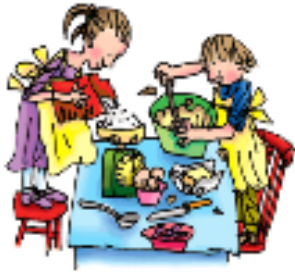
make a cake