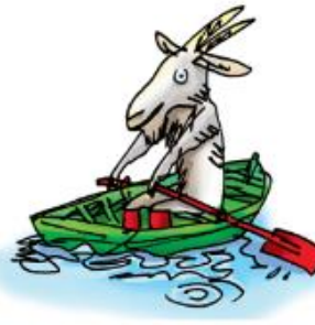
goat in a boat