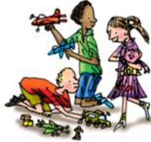
may I play?