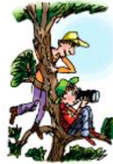
what can you see?