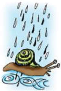
snail in the rain