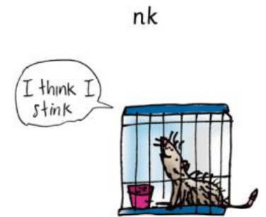
I think I stink