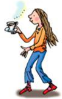
cup of tea