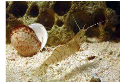
Shrimps and Shells